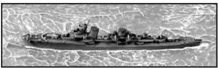
DL Tashkent - SUN7 2/pk $9.95