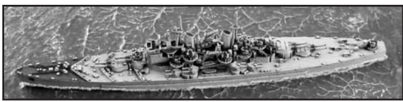
BB Vanguard - UKN46 1/pk $13.50