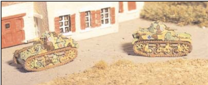
AMR-35 & AMR-35 Z2 FR20 $9.95 6/pk