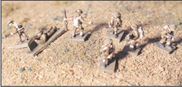
WWII British Individual Infantry #2 UK96 $9.95 60+/pk