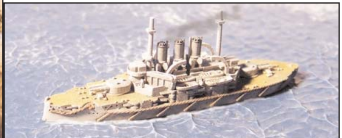
BB Pantelimon GWR10 $9.95 1/pk