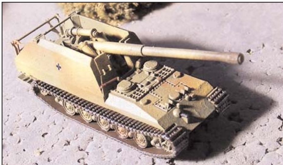
Geschützwagen Tiger für 17cm K72 (Sf) G546 $9.95 2/pk

Check out www.ghqonline.com for updates, get modeling tips, join fellow gamers & collectors on the forums, find gaming clubs and more!