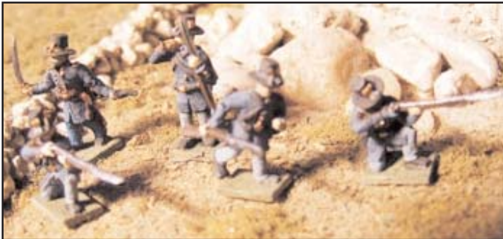
10mm Iron Brigade Skirmishers ACW 63 $7.95 27/pk