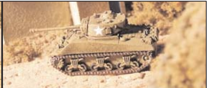
M4A3 Sherman 76mm US96 $9.95 5/pk