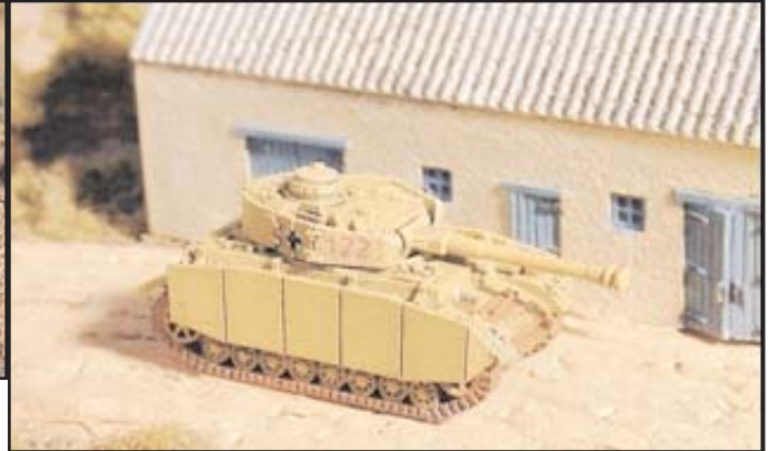
Pz IVH ("re-do") G548 $9.95 5/pk