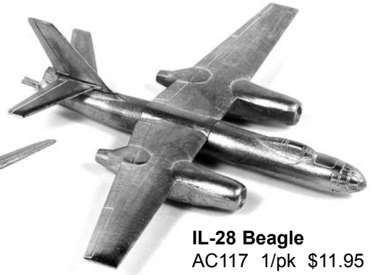
IL-28 Beagle AC117 1/pk $11.95