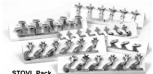
STOVL Pack (F-35s, Ospreys, Harriers, Sea Knights, Seahawks) HUS21 32+/pk $11.95