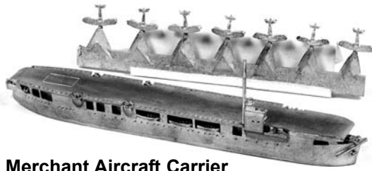
Merchant Aircraft Carrier Grain carrying hull UKN55 1/pk $16.95