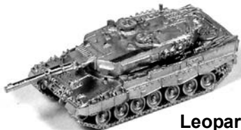
Leopard II A4 N600 5/pk $11.95