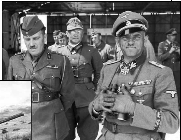
Oberst-Gruppenführer Joseph "Sepp" Dietrich, LSSAH commander, Greece 1941. (Pictured with General Franz Böhme, left.)

assigned troops—especially the ill-equipped Aussies and Kiwis fresh from North Africa—were already exhausted, and struggled in the freezing weather. In spite of this, they did manage to repel the Germans' initial forays into the area. However, on the morning of April 12, with the ground freshly blanketed in more than a foot of snow, the German onslaught really began.