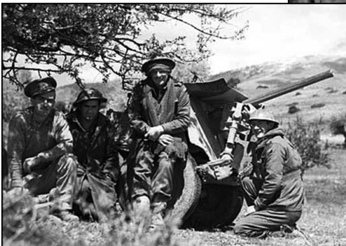
Members of the Australian 2/1st Anti-Tank Regiment resting, 13 April 1941, after their withdrawal from the Vevi area.