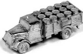
Opel Blitz, Open-backed with Fuel Drums G589 5/pk $11.95