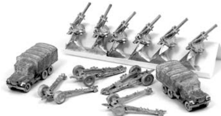
M114 Howitzer N599 2/2/2 $11.95