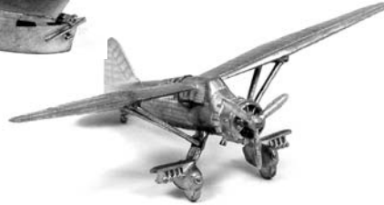
Westland Lysander AC116 2/pk $11.95