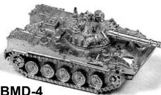
BMD-4 W113 5/pk $11.95