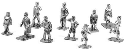
1/285th Modern Micro Armour® Western Civilians N602 60+/pk $11.95