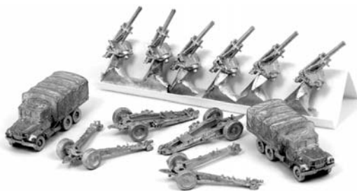
1/285th Modern Micro Armour® M114 Howitzer N599 2/2/2 pk $11.95