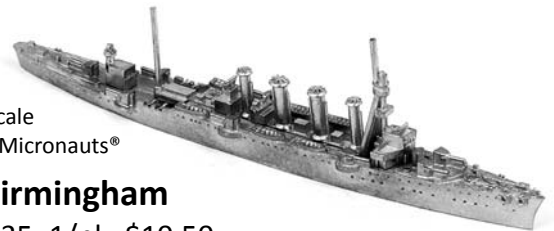
CL Birmingham GWB35 1/pk $10.50