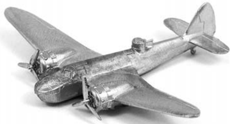
1/285th WWII Micro Armour® Blenheim Mk Bomber AC118 1/pk $11.95