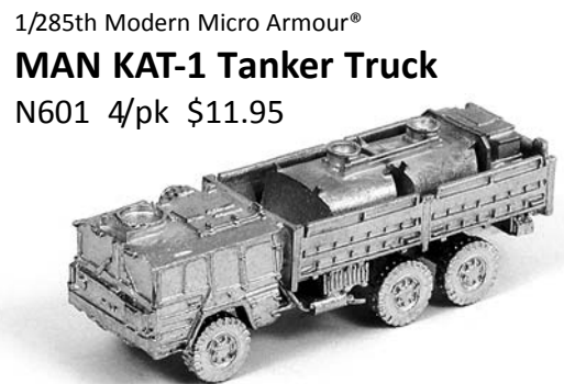
1/285th Modern Micro Armour® MAN KAT-1 Tanker Truck N601 4/pk $11.95