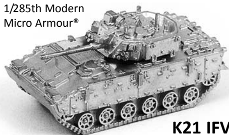
K21 IFV SK5 5/pk $11.95