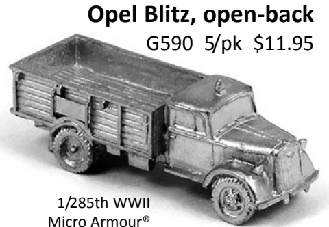
Opel Blitz, open-back G590 5/pk $11.95