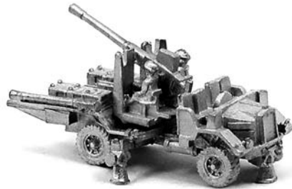
1/285th WWII Micro Armour® Self-Propelled Bofors AA UK107 3/pk $11.95