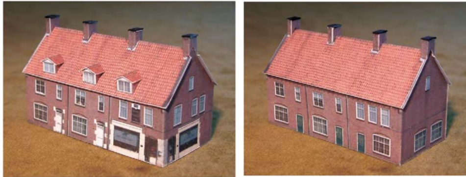
Finished row houses