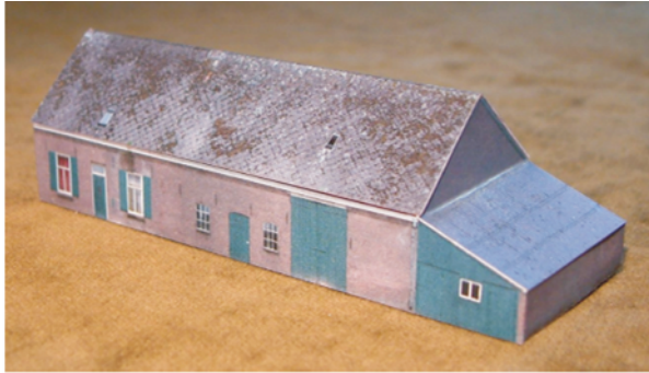
Finished farm house