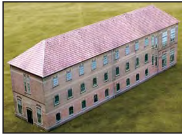
Finished ware- house